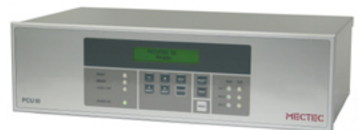
Printer Control Unit PCU III