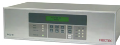
Printer Control Unit PCU III